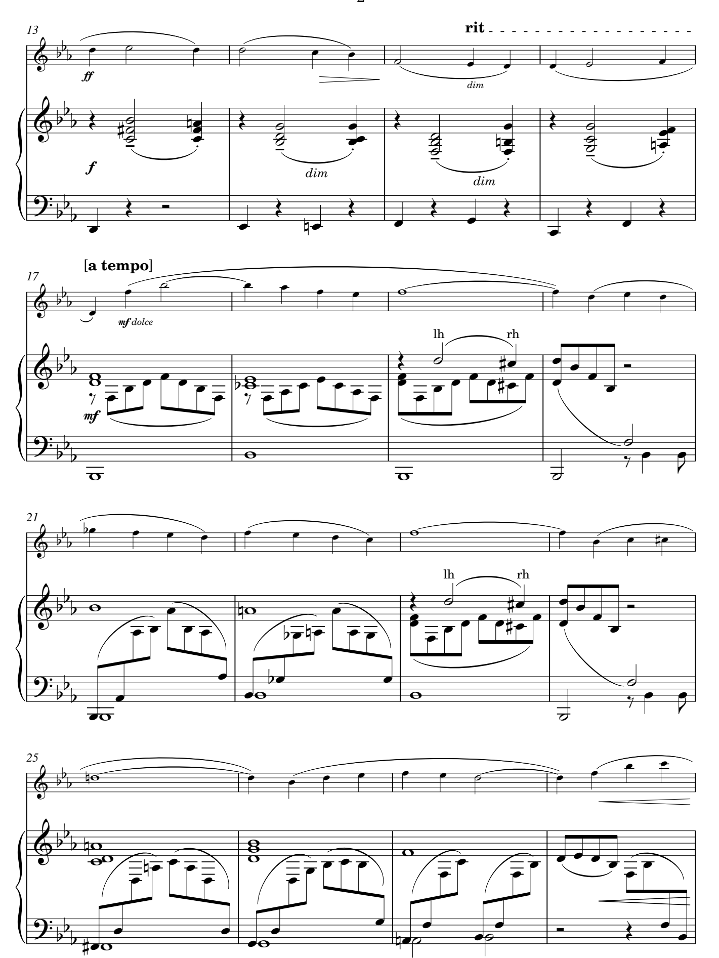
Rachmaninoff: Piano Concerto no 2/III © copyright 1901 by Hawkes & Son (London) Ltd This arrangement © copyright 2010 by Hawkes & Son (London) Ltd