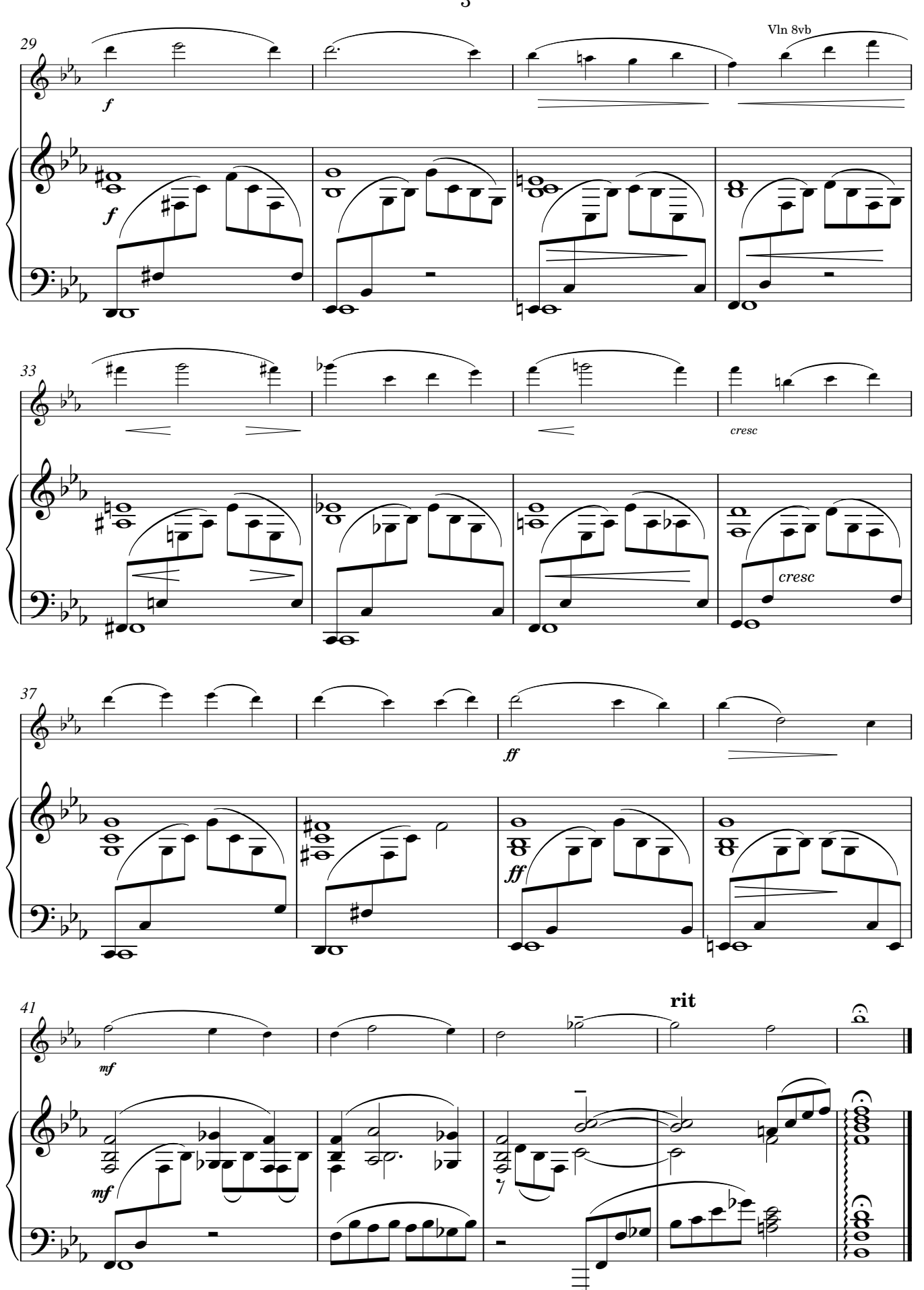
Rachmaninoff: Piano Concerto no 2/III © copyright 1901 by Hawkes & Son (London) Ltd This arrangement © copyright 2010 by Hawkes & Son (London) Ltd